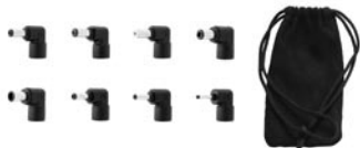
Adapter plug kit with drawstring bag (8 adapter tips)